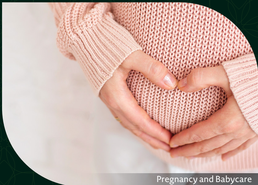
Pregnancy and Babycare