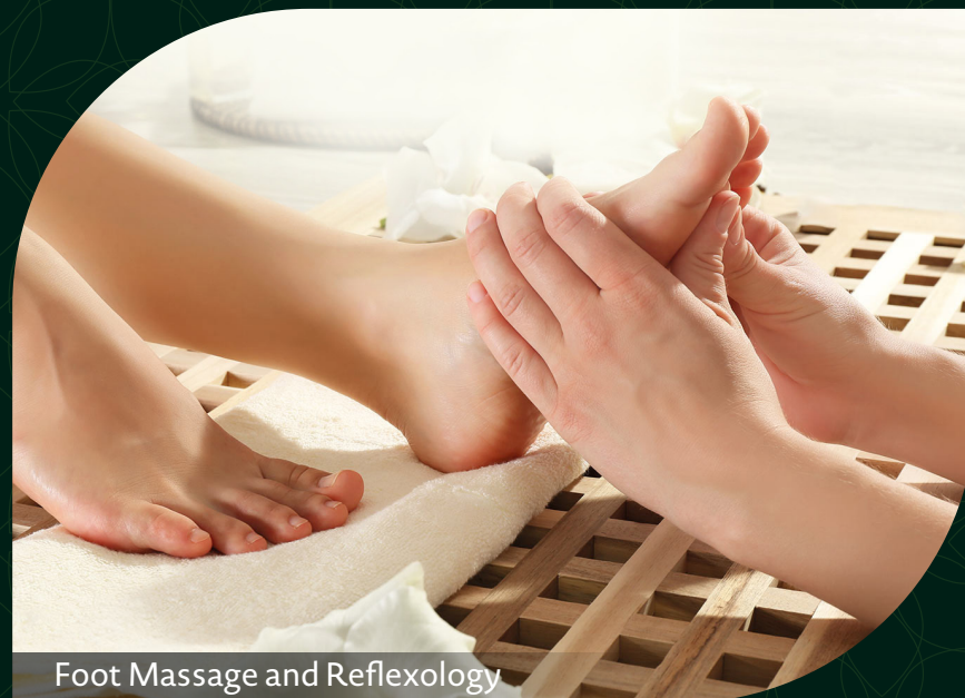
Foot Massage and Reflexology